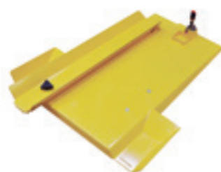
Conversion kit tracked base