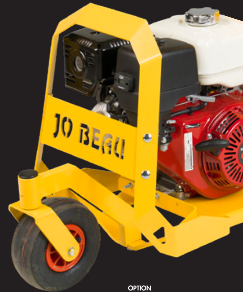
OPTION FRONT WHEEL

The CO 2 -emission-free E300 with its 11Kw powerful electric motor is the best option for indoor use . When the motor is activated, a minimum of decibels is released, making working with this powerhouse even more pleasant.