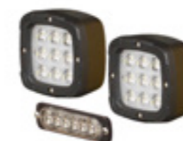
Work light set