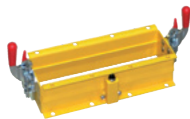
Detachable piece chute