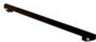
Wheel fixation bar