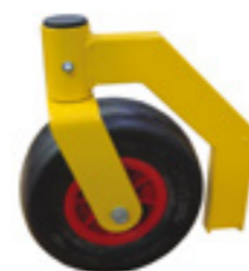
Front swivel wheel