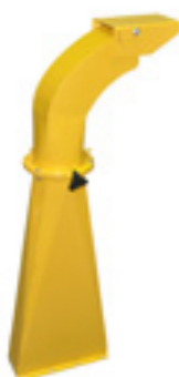
High rotating chute