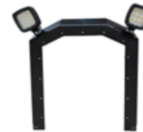
Work light set