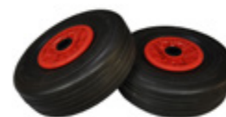
Leakproof swivel tires