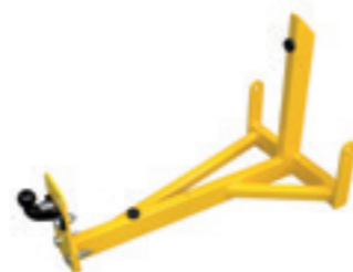
Lifting kit trailer